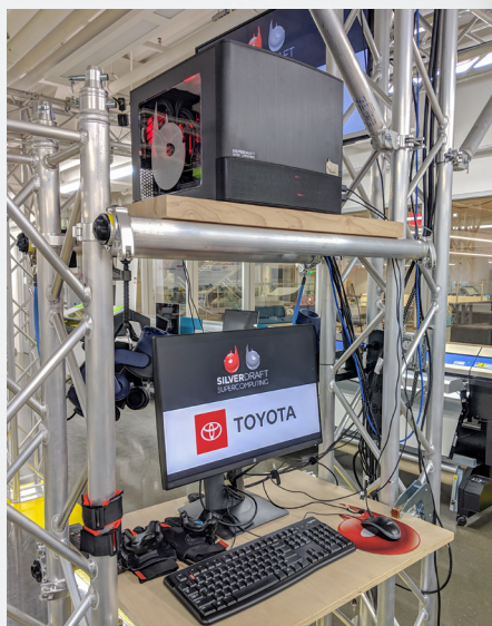
Toyota's DemonVR system with two RTX 6000 GPUs

Toyota Motor Corporation is known for quality and reliability in the automotive industry. Continuous improvement is one of the core principles of the organization. Always looking for ways to improve and innovate its processes, Toyota wanted to make the new model development process more efficient and cost-effective. Engineers wanted more flexibility, easier collaboration, and the freedom to test new ideas without having to resort to expensive and time-consuming Rapid Prototyping (RP) whenever more data was required. A number of possibilities were explored until they discovered Silverdraft, a full solutions company, who implemented the use of Extended Reality (XR) environments as part of Toyota's new workflow. A key component of Toyota's solution was Silverdraft's DemonVR workstation equipped with two high performance NVIDIA Quadro RTX 6000 GPUs.