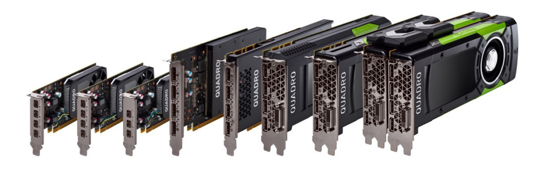
Figure 1. NVIDIA Quadro Graphics Cards

This application note discusses the power requirements of the NVIDIA® Quadro® line and Quadro RTX^{\scriptscriptstyle TM} line of graphics cards. A suitable power supply is necessary to maintain system integrity under computational load.