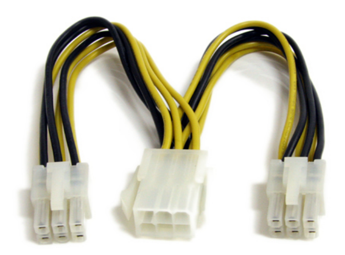
Figure 3. 6-Pin Y-Splitter Cable