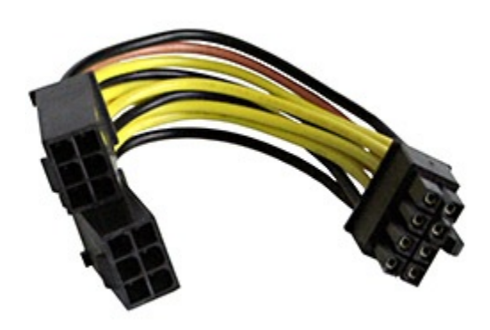
Figure 5. Dual 6-Pin to 8-Pin Adapter Cable

It is possible to combine two 6-pin auxiliary PCIe connectors into a single 8-pin auxiliary PCIe connector. If you are using such an adapter, it is important to ensure that the 12V rail on the power supply driving this adapter is rated for at least 18A.