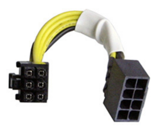
Figure 4. 8-Pin to 6-Pin Adapter Cable

It is possible to split a single 8-pin auxiliary PCIe connector into a single or two 6-pin auxiliary PCIe connectors. If you are using such a splitter, it is important to ensure that the 12V rail on the power supply driving this is capable of handling the additional connector. Refer to the rated amperage on the 12V rail sourcing the splitter to ensure that the connector limits are not exceeded.