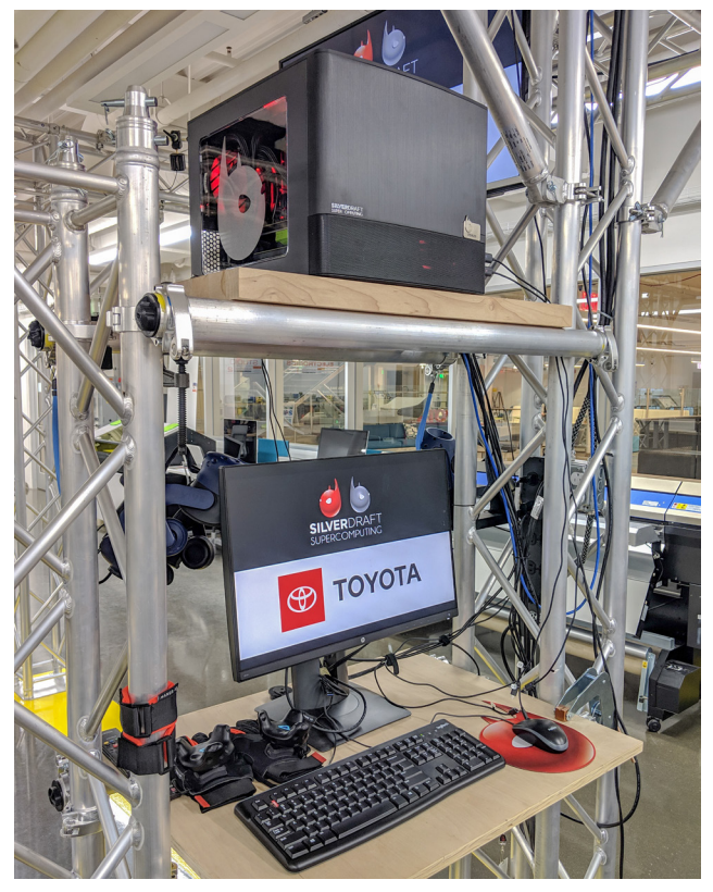
Toyota's DemonVR system with two RTX 6000 GPUs

THANKS TO NVIDIA PROFESSIONAL GRAPHICS AND SILVERDRAFT WORKSTATION