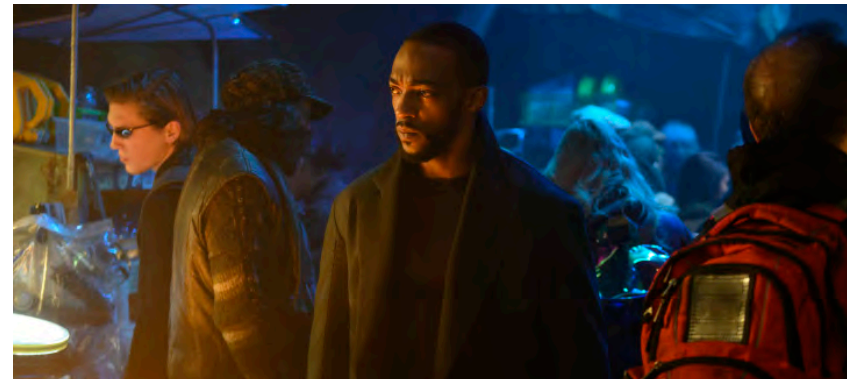
Altered Carbon 2