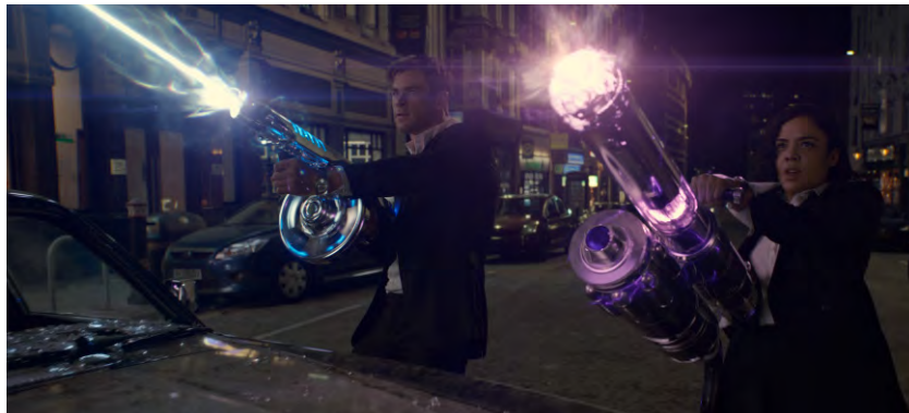
Men In Black

infrastructure, spinning up virtual workstations, render nodes, and scaling resources as needed. Professionals can centralize projects in the data center or cloud for greater control, and flexibility with multi-user collaboration using the NVIDIA Omniverse™ platform. Studios who still need access to physical NVIDIA RTX™ and NVIDIA® Quadro RTX™ desktop workstations for specific hardware configurations or data requirements, NVIDIA's hardware and software partners offer a variety of solutions for secure, remote access. Studios that are looking for more flexibility with mobile computing, NVIDIA RTX and Quadro RTX mobile workstations are now capable of desktop-class performance to help artists to stay productive anywhere.