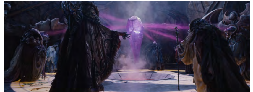
Dark Crystal © 2019 Netflix | Image courtesy of DNEG

Employees can leverage NVIDIA vPC and vApps for general-purpose virtual desktop infrastructure (VDI) running Windows 10 and modern productivity applications. Creators can also stream video and multimedia using interactive training platforms and teleconferencing.