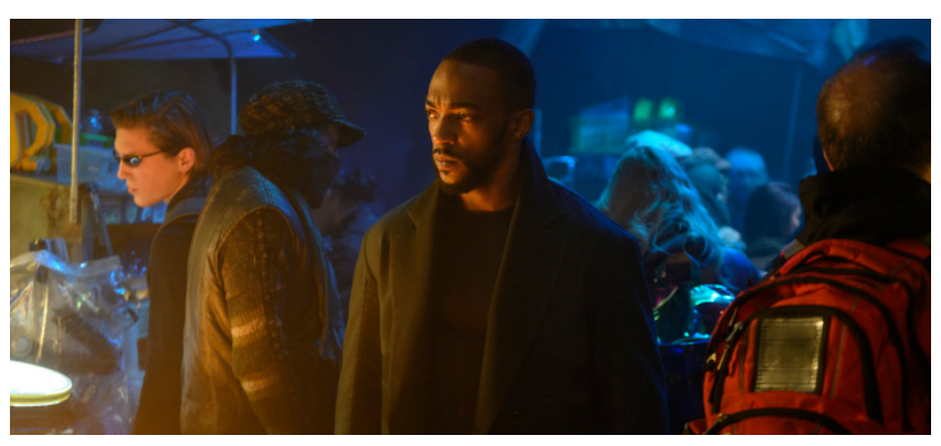
Altered Carbon 2