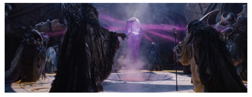
Dark Crystal © 2019 Netflix | Image courtesy of DNEG

Employees can leverage NVIDIA vPC and vApps for general-purpose virtual desktop infrastructure (VDI) running Windows 10 and modern productivity applications. Creators can also stream video and multimedia using interactive training platforms and teleconferencing.