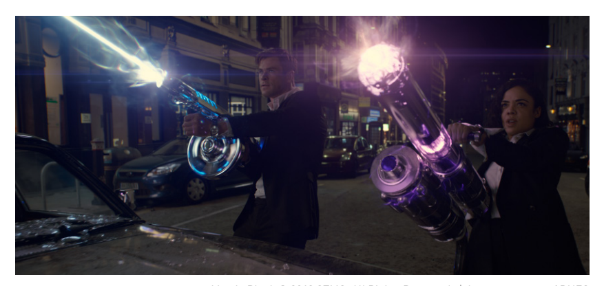
Men In Black © 2019 CTMG. All Rights Reserved. | Image courtesy of DNEG

infrastructure, spinning up virtual workstations, render nodes, and scaling resources as needed. Professionals can centralize projects in the data center or cloud for greater control, and flexibility with multi-user collaboration using the NVIDIA Omniverse™ platform. Studios who still need access to physical NVIDIA RTX™ and NVIDIA® Quadro RTX™ desktop workstations for specific hardware configurations or data requirements, NVIDIA's hardware and software partners offer a variety of solutions for secure, remote access. Studios that are looking for more flexibility with mobile computing, NVIDIA RTX and Quadro RTX mobile workstations are now capable of desktop-class performance to help artists to stay productive anywhere.